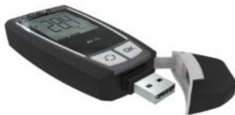
USB connection Waterproof closure